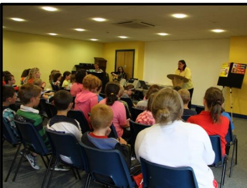
45 Children attended the Junior Camp at Killeel