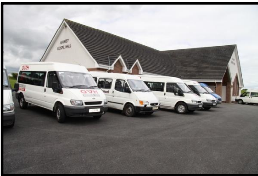
A fleet of minibuses sitting in dock

The Holiday Bible Clubs are far from a holiday, they take a lot of organising, preparation and hard work – Just like fishing. It was amazing this year again to see Ahorey Gospel Hall well filled with an average of 100 children each day to learn to be one of “God’s Special Agents.” The theme, this year, was all built around the idea of learning to share the Gospel with others. Obviously before you share anything you must understand it so we spent the main Bible teaching hour explaining,